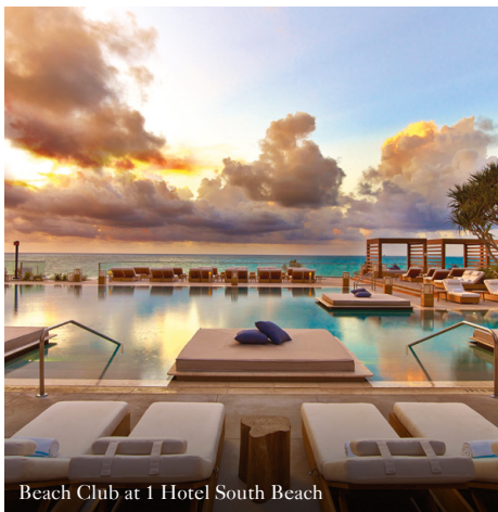
Beach Club at 1 Hotel South Beach

The private marina, planned riverside restaurant and lushly landscaped river promenade invite residents to spend hours and days luxuriating in the infinite energy and organic sparkle of life by the water. Watch the superyachts come and go, take a sunset stroll towards the bay, or head to a number of chic waterside restaurants courtesy of our private water taxi service. Residents can enjoy private membership and exclusive access to the Beach Club at 1 Hotel South Beach, SH Hotels & Resorts sister property. With loungers, beach towel services, cabanas, and seaside snack and beverage services, this waterfront community will cater to leisurely hours under the sun. Take a break from the hustle and bustle of the city and unwind with a cool drink in hand and the sand between your toes.