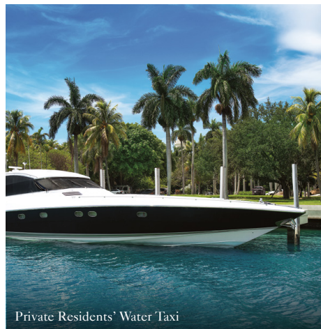
Private Residents' Water Taxi