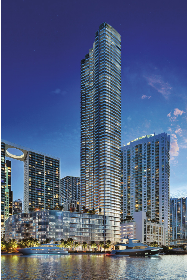
Above: Artist's Conceptual Rendering